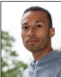
COVER DESIGN: Holly Turner

October 2013 | 104 pp. | 6" x 9" Trade Paperback | $16.99 ISBN-13: 978-1-940939-01-8 (pbk.) ISBN-13: 978-1-940939-02-5 (epub) LCCN: 2013953968